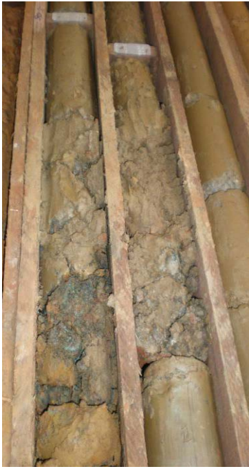
Copper bearing saprolite in drill core recovered from current core drilling programme