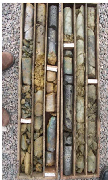
Hole ARVD-141 3.9m of high grade copper mineralisation has been recorded in drill logs.