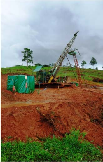
Avanco has completed 20 holes for ~2,150m at the Serra Verde Project.

Drilling at Serra Verde will continue to target a substantial IOCG discovery to complement the Antas South Copper Deposit on the adjacent Rio Verde Project, refer to Figure 1.