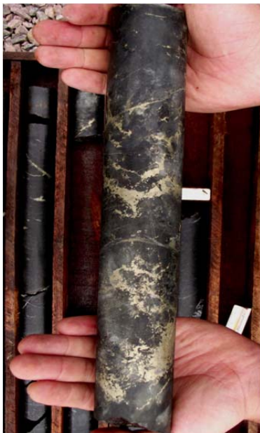
Early success at the Serra Verde Project ASVD-02