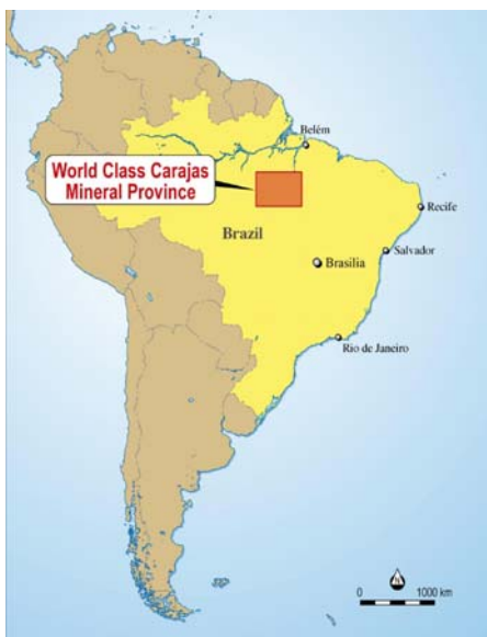
Avanco's Projects are located in the Carajas, northern Brazil