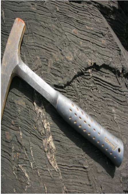
BIF has recently been identified at the Trindade North Property