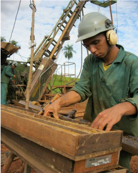
Half of the planned 2,000m Antas South High Grade Zone drill programme is completed

Core logging has identified high concentrations of malachite and chalcocite in the highly mineralised intersections. The Company anticipates completion of the 2,000m programme during the September quarter with a revised resource estimate calculated shortly thereafter.