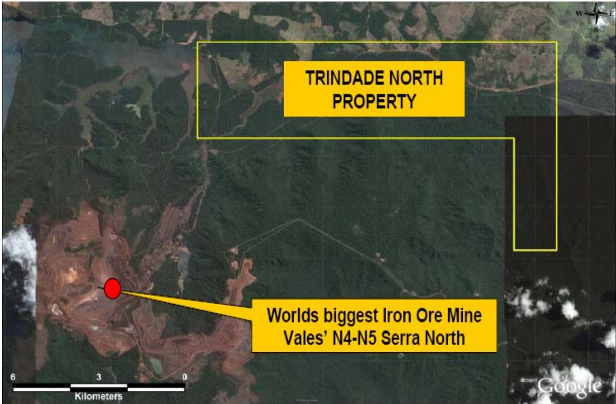
Land satellite image showing the boundaries of Avanco's Trindade North Iron Ore Property